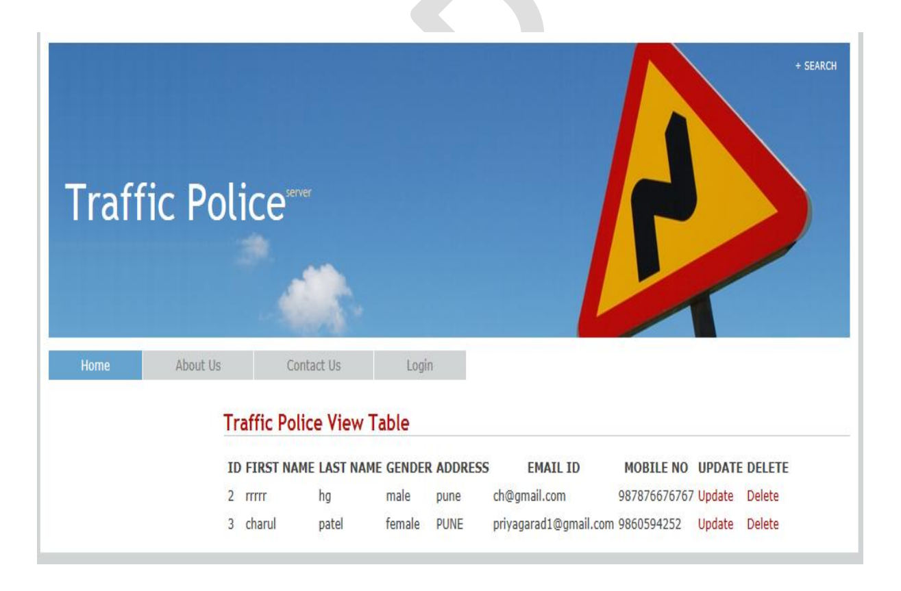
Fig. 2: View table list of traffic police