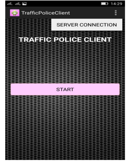
Fig. 5: Starting the Server connection