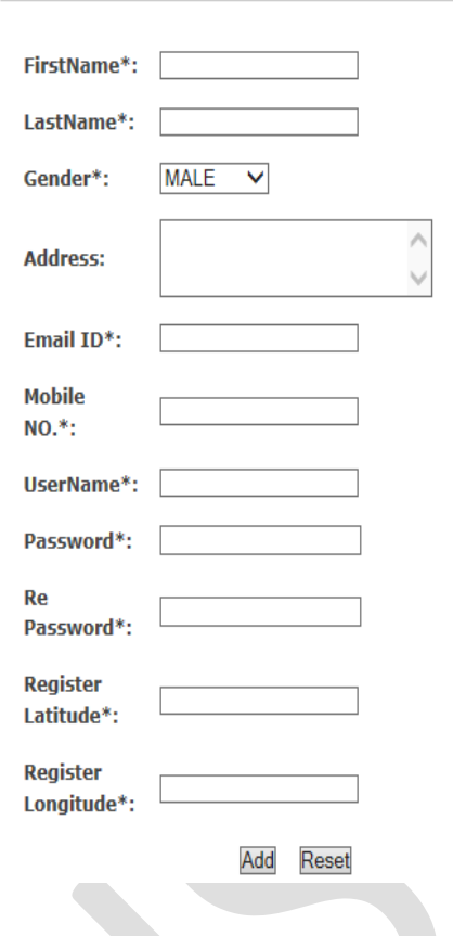
Fig. 3: Adding new user (traffic police)