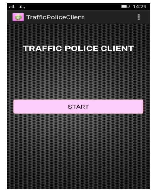
Fig. 4: Home Page