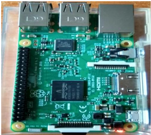
Figure.2 Raspberry Pi

Raspberry Pi is a small credit-card sized minicomputer. It supports Python language. It has forty GPIO pins. It has onboard Bluetooth and Wi-Fi. It has 1Giga Bytes of RAM and has a memory slot.