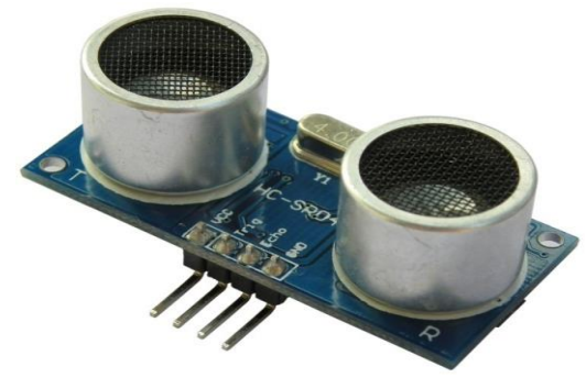
Figure.5 Ultrasonic sensors

Ultrasonic sensors transmit ultrasonic waves in cone shaped beam. It has four pins Trigger, Echo, VCC and GND. Ultrasonic waves transmitted have a frequency of about 30MHz.