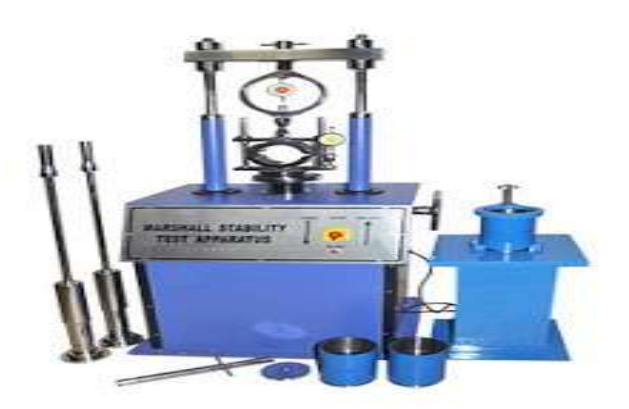
Figure 1: Marshall stability

To manufacture Marshall specimens, the materials were manually mixed into a metallic bowl at a constant rate of 100 rpm. Previous to mixing process, aggregates were heated at a temperature of 150°C during 24h, while bitumen and steel fibers were heated at the same temperature but during 2h. Therefore, the materials were added into the bowl in the following order: first, bitumen and fibers; second, coarse aggregate; third, fine aggregate and finally, filler. All materials were mixed during approximately 3.5min at a constant temperature of 150°C into the bowl. After the mixing process all materials were put into a Marshall mould with a diameter of 10cm and height of 6 cm and then compacted applying 75 blows on each side of the specimen with a Marshall Hammer. After compaction and cooling of the specimens to ambient temperature, Marshall specimens were mechanically extracted from the mould. Finally, Marshall Specimens of asphalt mixture type were manufacture.