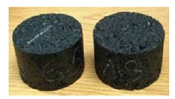
Figure 2: Marshall stability mould IV. TEST METHODS